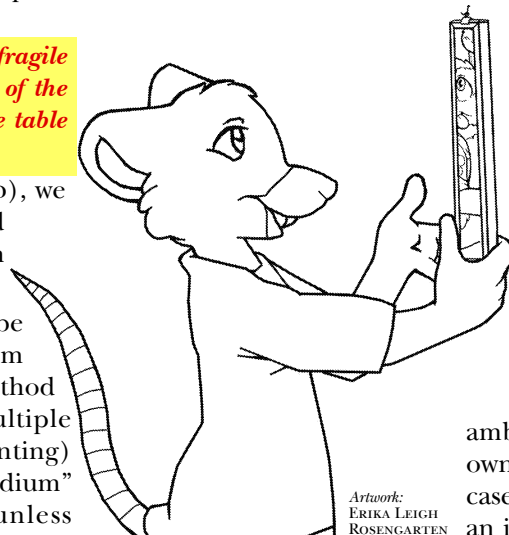
Artwork: ERIKA LEIGH ROSENGARTEN

6. Panels will be lit by reflector floodlamps attached to an overhead framework. Tables will be illuminated by ambient room light. If you want to bring your own electrical equipment (e.g. a lighted display case) or if your work requires electrical power as an integral part of the work (e.g. lamp or kinetic